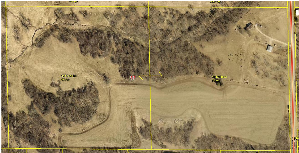
Figure 2: GIS map with aerial photo showing two parcels of land owned by Steven Bruce Behrens on O Avenue, Washington Township, Iowa County, Iowa. The former Clifford farm is the parcel to the west.